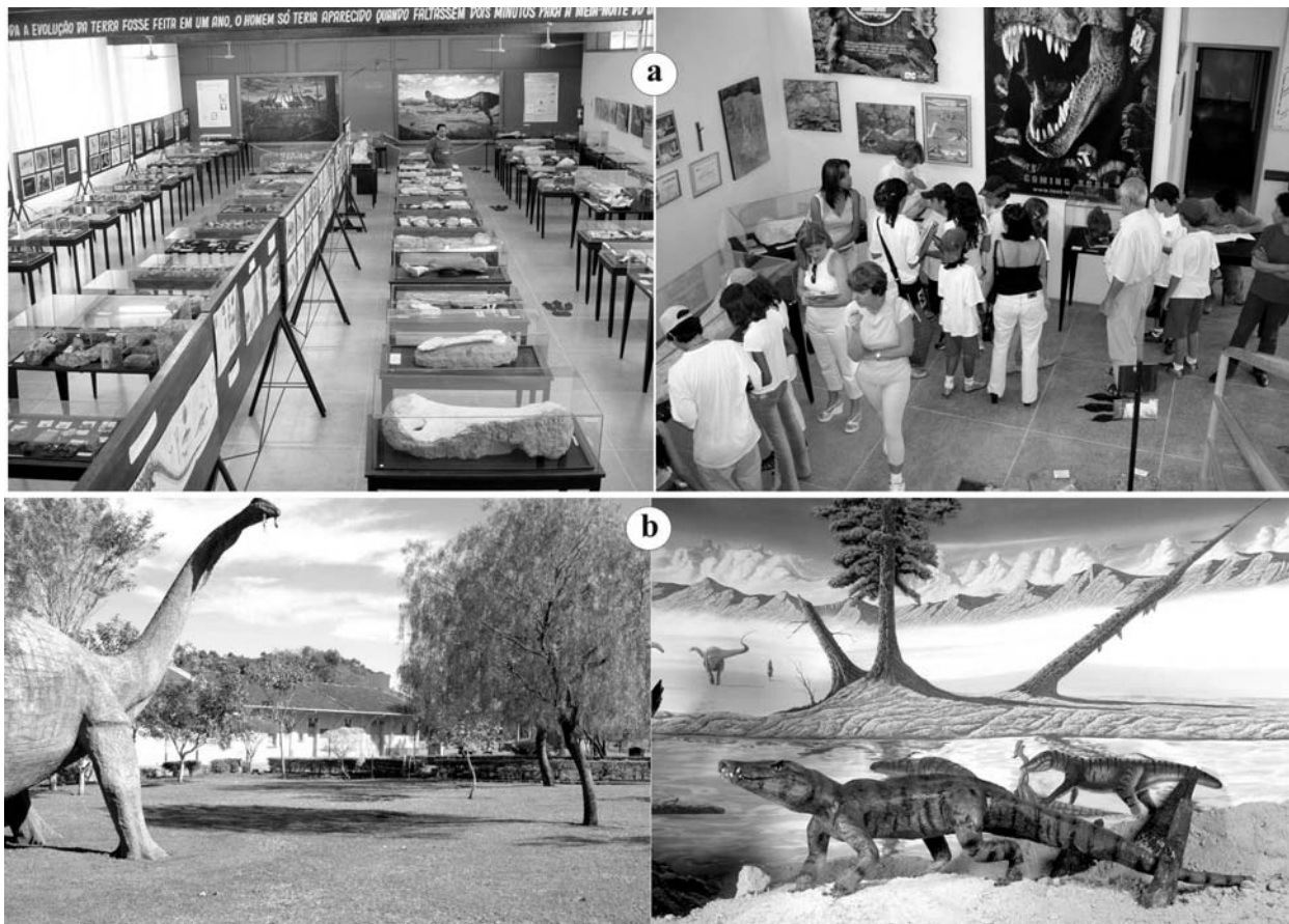
Fig.4- Cretaceous dinosaurs, at southeastern Brazil: a) 'Museu de Paleontologia' at Monte Alto, São Paulo; b) 'Museu dos Dinossauros', at the 'Centro de Pesquisa Paleontológica Lewellyn Ivor Price', at Peirópolis, Uberaba.