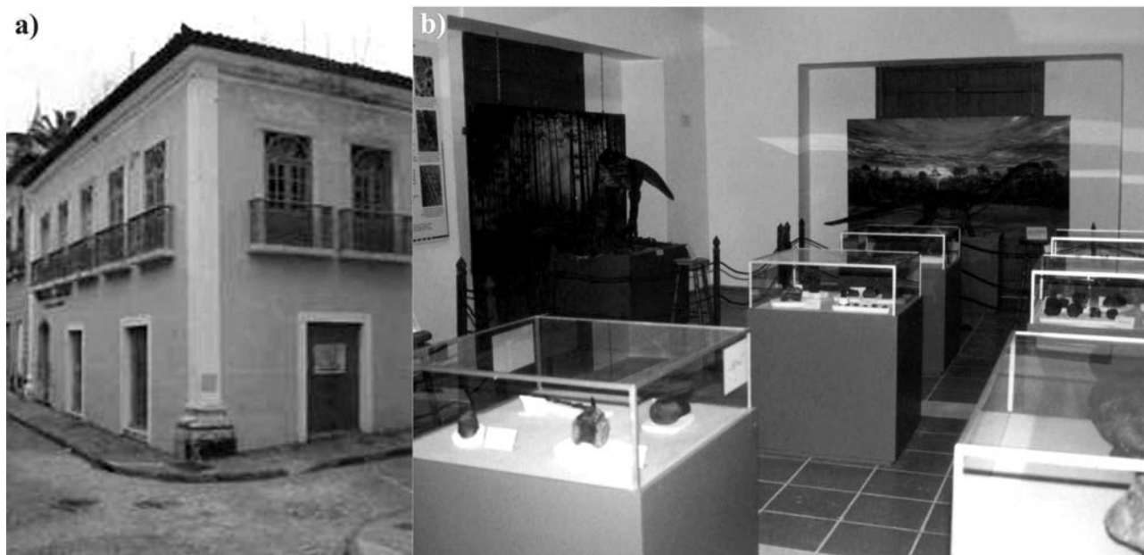
Fig.7- 'Cajual Island', at northern Brazil: external view (a) and exhibit room (b) of the 'Centro de Pesquisa de História Natural e Arqueologia do Maranhão', at São Luís -Maranhão.

At Belém, the Museu Paraense Emílio Goeldi houses a collection concerning the main fossil groups found in the Northern Brazilian basins.