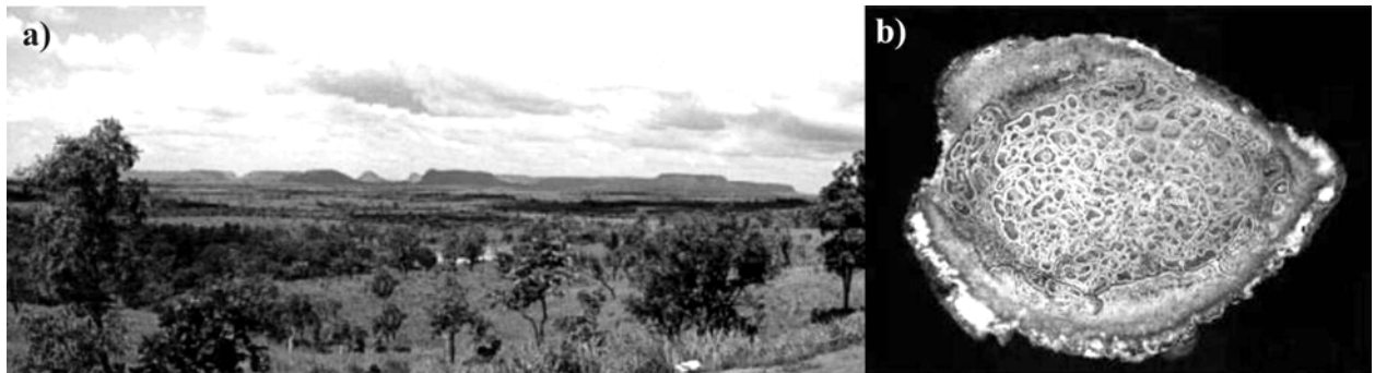
Fig.2- The Great Petrified Forest from Central Brazil: a) outcrops of the Pedra de Fogo Formation (Parnaíba Basin); b) permineralized log ( Psaronius sp.).