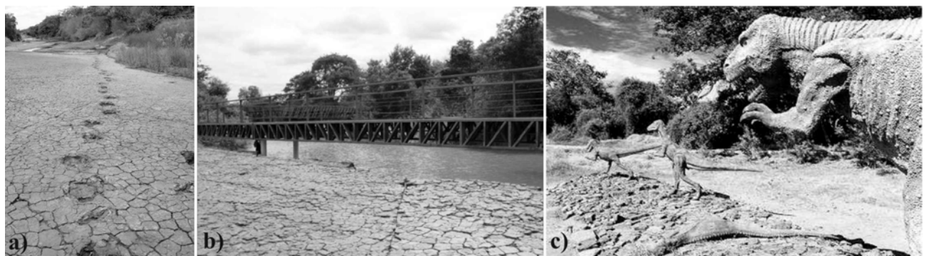
Fig.6- 'Parque Vale dos Dinossauros' at Sousa, Paraíba: a) sauropod track; b) steel bridge over dinosaur tracks; and c) reconstruction of theropod track-makers.

The sedimentary basins have a rich dinosaurian and non-dinosaurian ichnofauna (LEONARDI & CARVALHO, 2002). The most important site is located at 'Passagem das Pedras', transformed into a park with guided tours, and a whole infrastructure for the preservation of the ichnofossiliferous site (Fig.6). Investments already exceeded US$ 800,000.00, in the infrastructure detailed in CARMO & CARVALHO (2004): modification of the main course of the river, to protect the fossil levels; reforestation of native vegetation; road access to the park; steel bridges over the fossiliferous rocks; construction of a reception center. The park contains a permanent exhibit, TV and video room, library, souvenirs store, snack bar, restrooms and administration rooms, as well as reconstructed fossils outside.