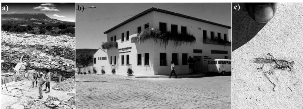
Fig.5- 'Chapada do Araripe', at northeastern Brazil: a) outcrops of the Crato Member (Santana Formation, Araripe Basin); b) 'Museu de Paleontologia', at Santana do Cariri; c) well preserved insects.