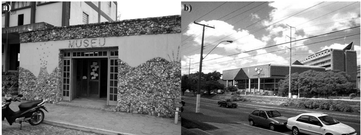
Fig.3- The Paleontological Route, at southern Brazil: a) 'Museu Guido Borgomanero' at Mata; b) 'Museu de Ciência e Tecnologia - PUCRS', at Porto Alegre.

In order to avoid depredation and illicit fossil commerce (FERNANDES & CARVALHO, 2000), several museums now exist: