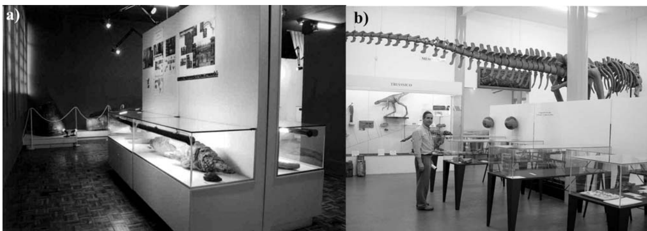
Fig.9- Fossil exhibits at: a) ‘Centro de Paleontologia de Mafra’, state of Santa Catarina; b) the Natural History Museum of Taubaté, State of São Paulo.

The use of the fossiliferous sites and the fossils found there must be based on an educational program, fiercely attached to a strong legislation. In this case, fossil commerce and depredation may diminish, or even finish. However, the government (federal, regional and local) must always provide the means to protect and inspect the use of the paleontological patrimony.